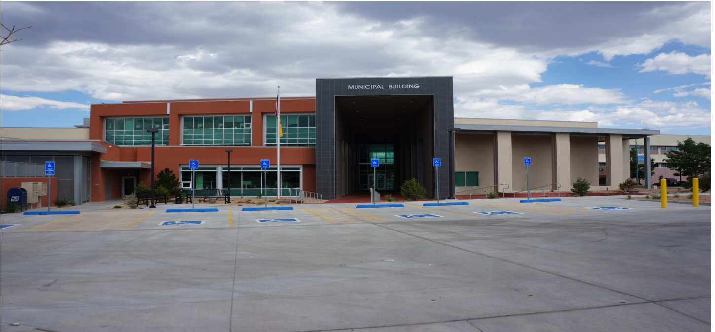
The front entrance to the Los Alamos Municipal Building. The county moved most departments into the building in May, 2013.