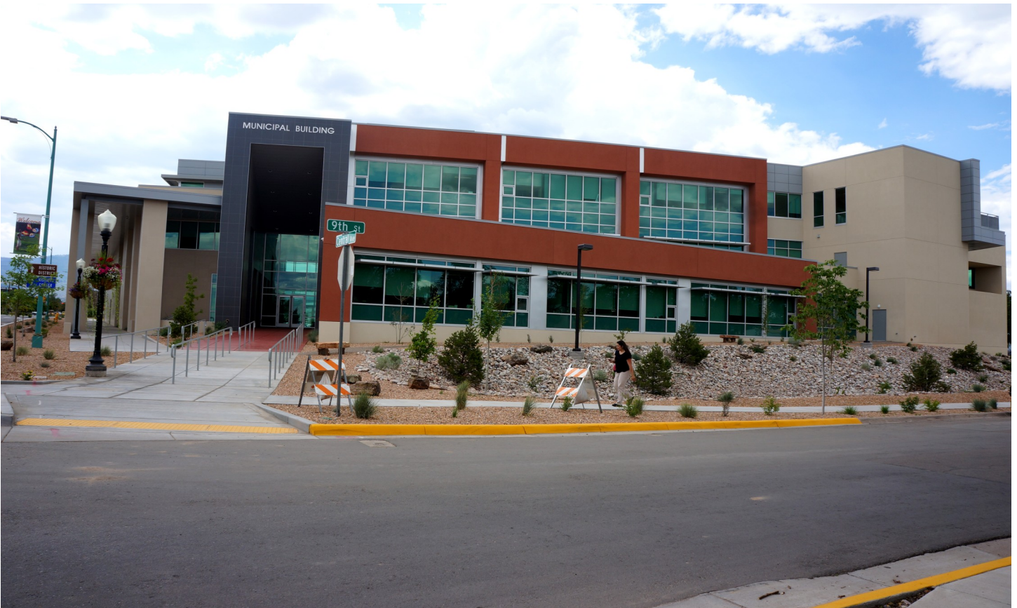
The back entrance to the Los Alamos Municipal Building.