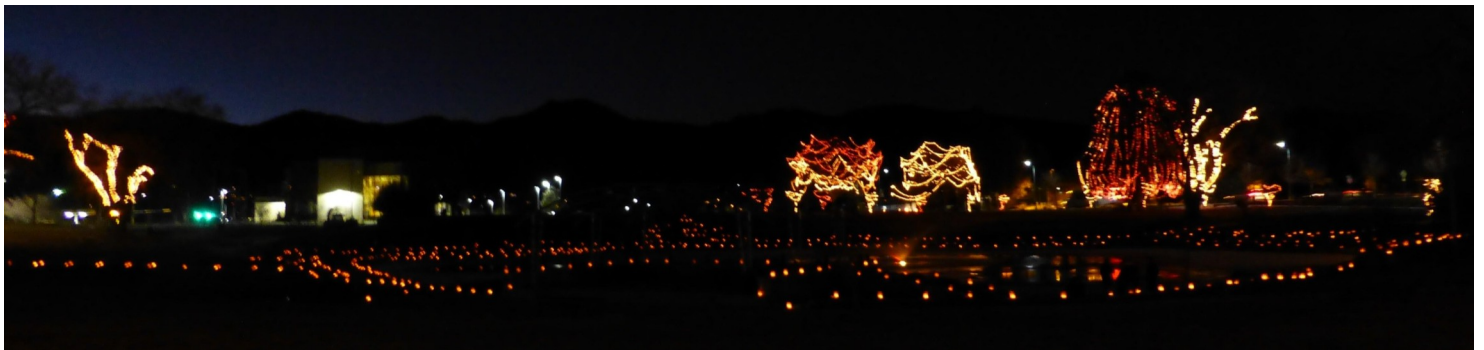
Lights Across Ashley Pond