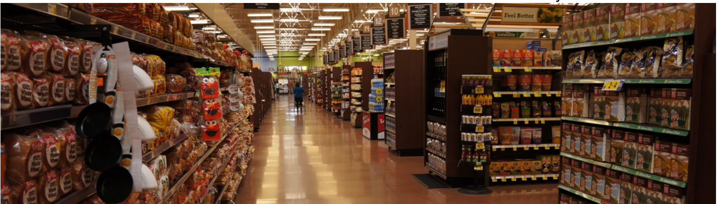
And miles of shelving