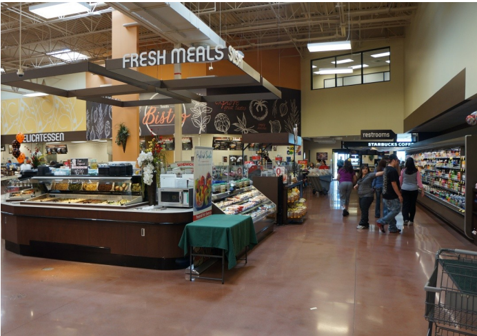
Deli, Fresh Meals, and Starbucks (in background)