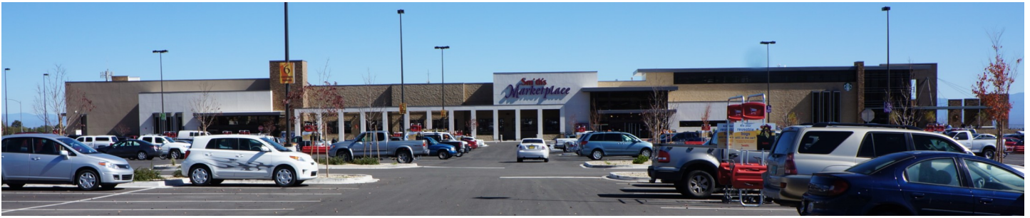
Shown is the front of the Smith's Marketplace. The patio shown below is on the right side.