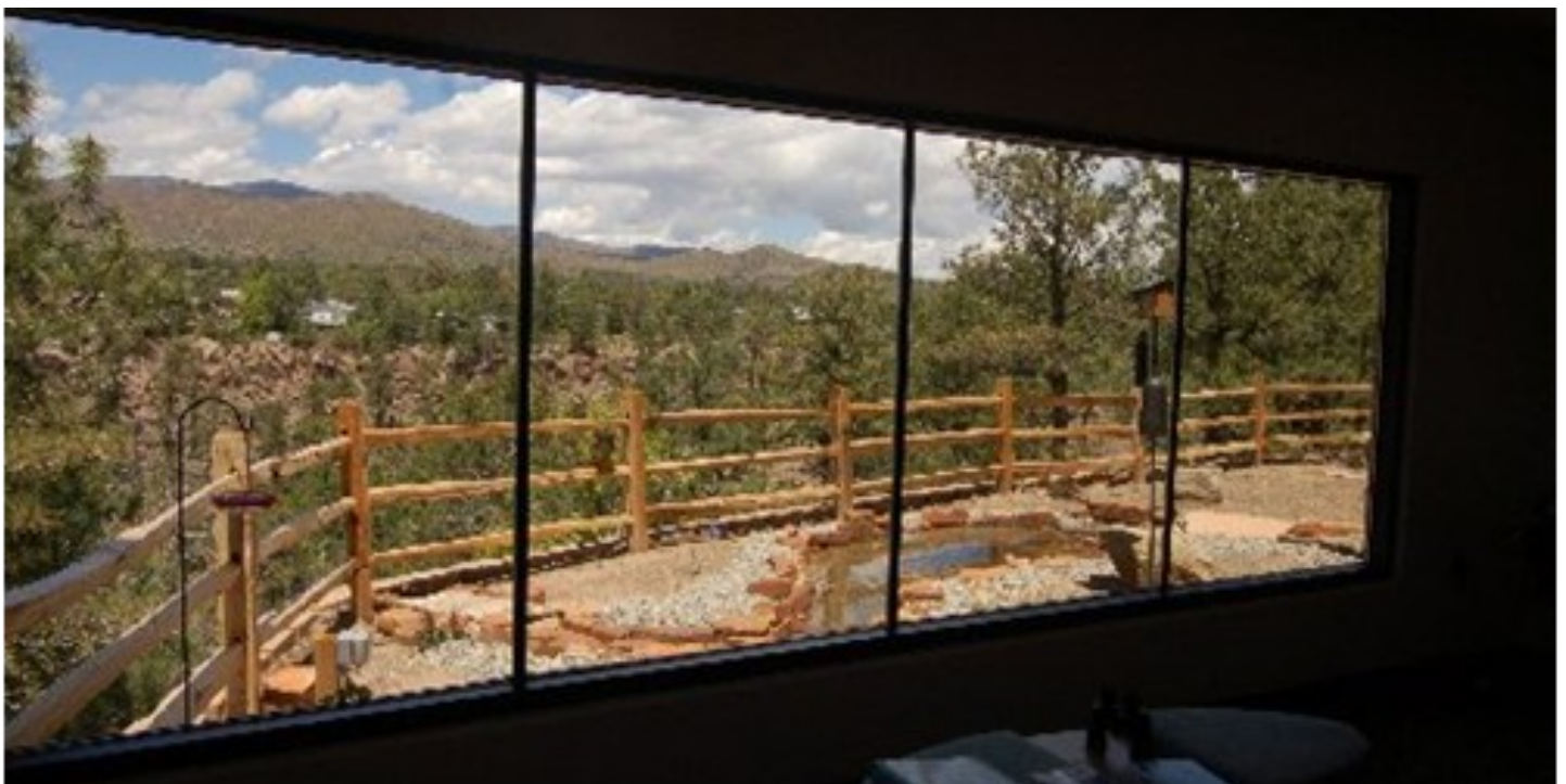
View out the Back