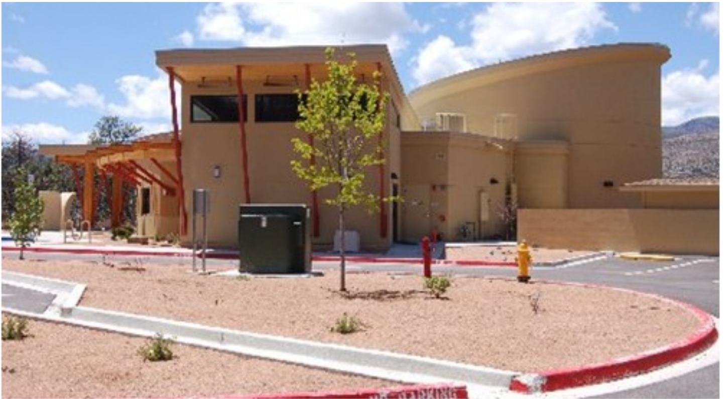
View of the Front