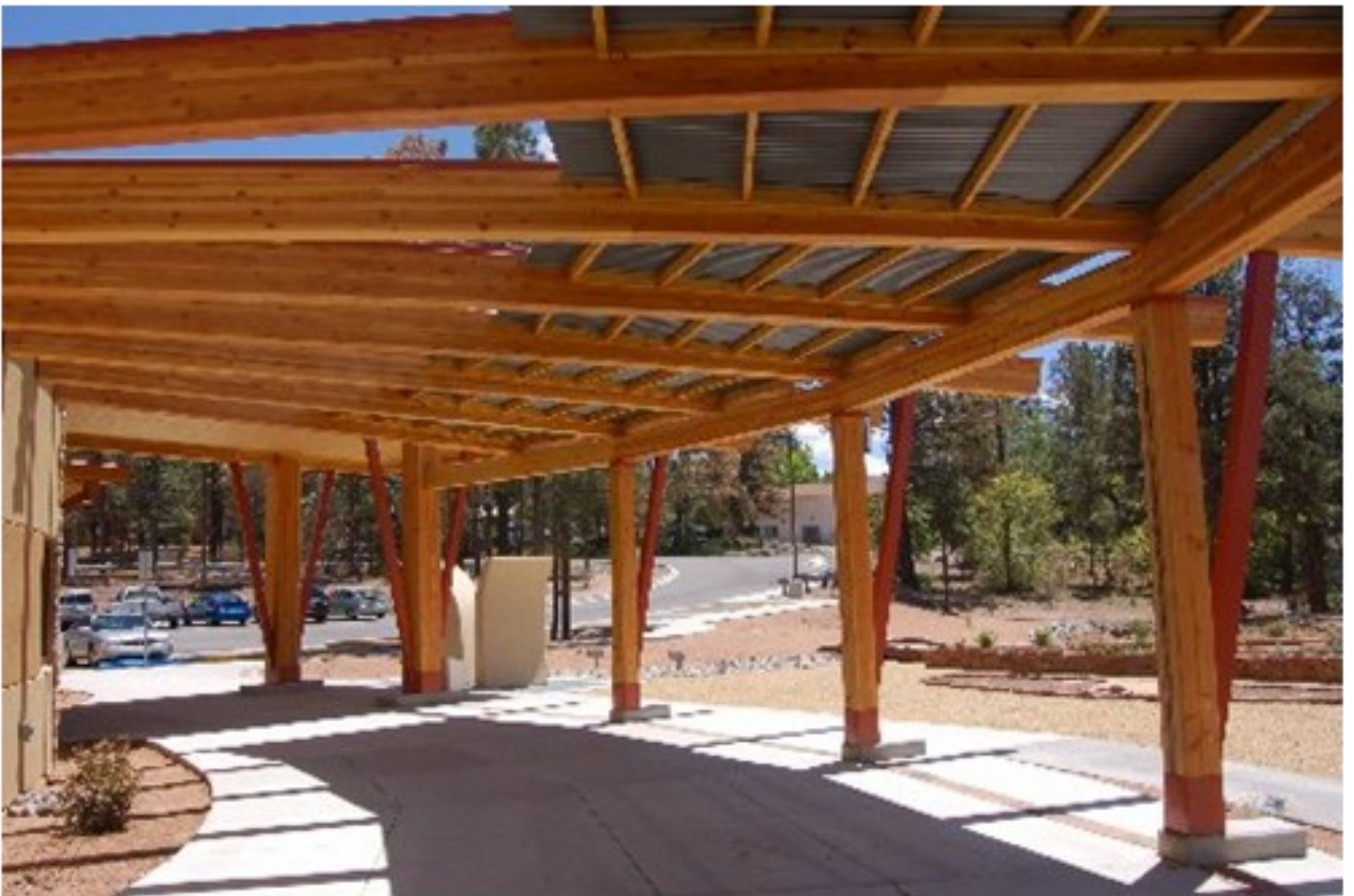
Looking toward Canyon Road