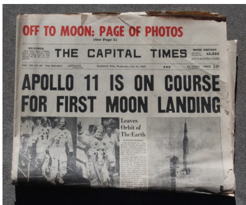
The Capital Times (Madison, WI) - July 16, 1969

More of Stan's newspaper headlines on the following page.