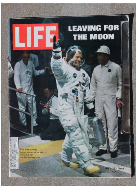
Life Magazine—July 25, 1969