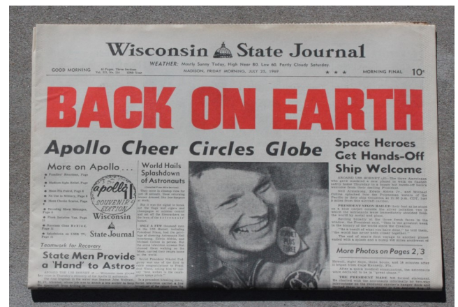
Wisconsin State Journal—July 23, 1969