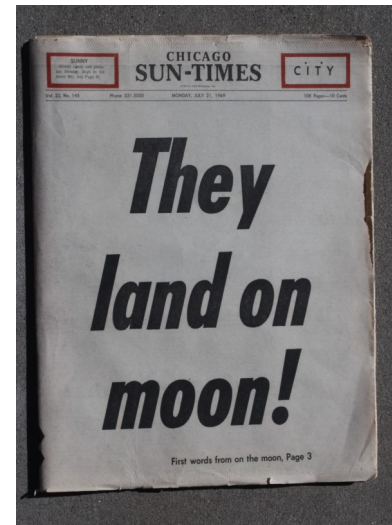
Chicago Sun-Times July 21, 1969