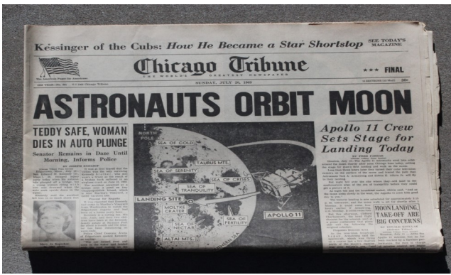
Chicago Tribune—July 20, 1969