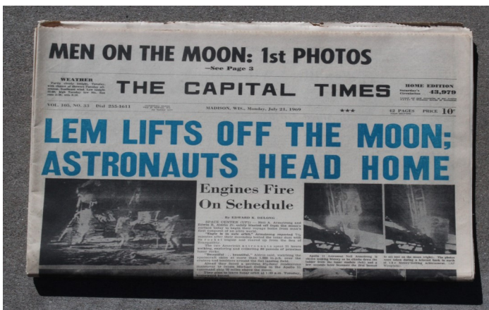
The Capital Times (Madison, WI) — July 21,