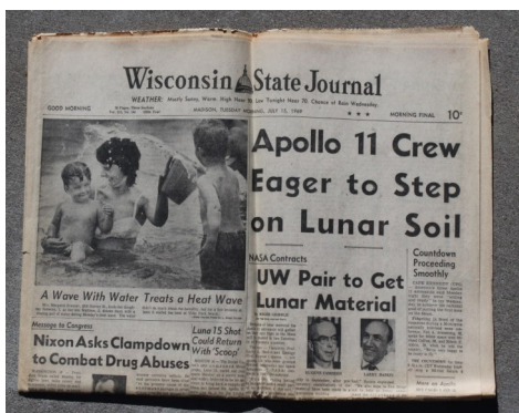
Wisconsin State Journal July 15, 1969