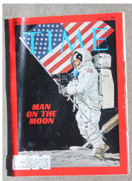
Time Magazine—July 25, 1969