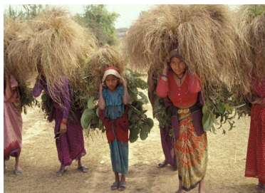
Figure 12 Friendly girls going home from working in the field.