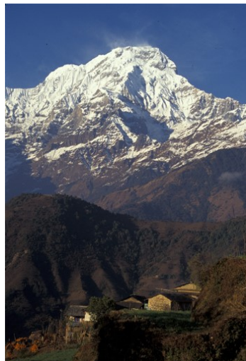
Figure 10 Mt. Annapurna and village at bottom of picture.