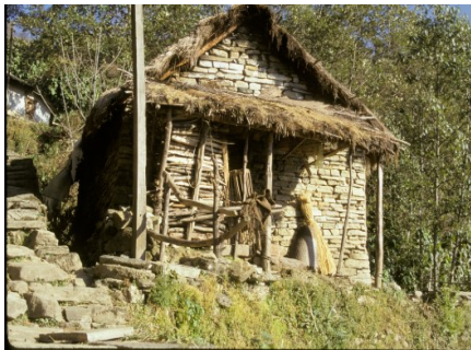
Figure 4 Old cottage near the hiking trail. Old but beautiful.