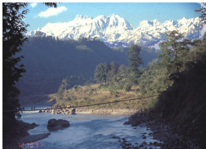
Figure 3 Rope bridge across the river. There are many along the trail. Start of the hike.