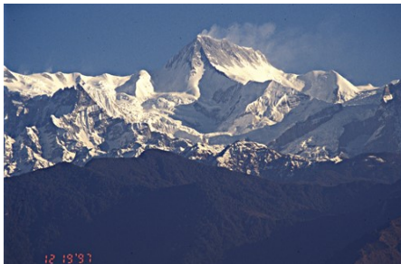
Figure 7 Beautiful scenery in the middle of the Himalayas.