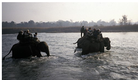
Figure 13 Another form of hiking. A half-day excursion on elephant back.