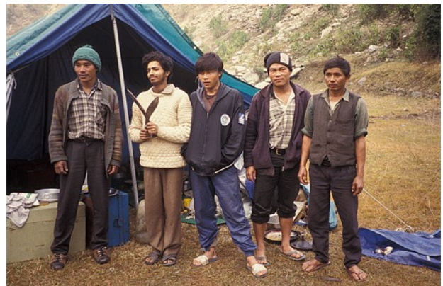
Figures 1 and 2 The hiking crew on the left picture. The Sherpas on the right. They carried most of our heavy stuff. They also carried our dining room table.