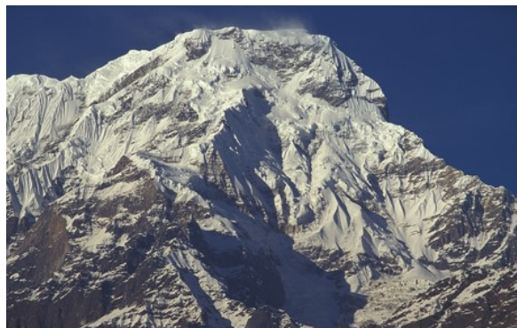
Figure 11 The peak of Annapurna. The top is at 26545 ft.