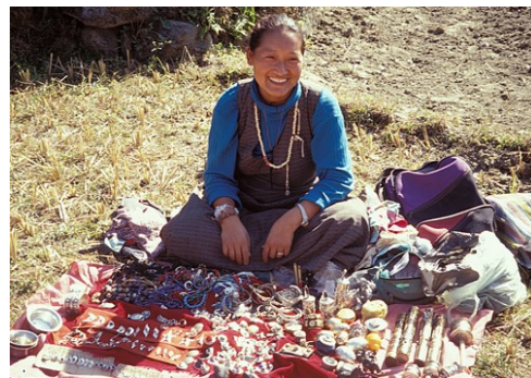
Figure 5 Girl from Tibet selling her artwork. She walks across the mountains to do this.