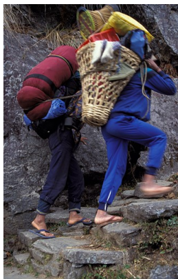
Figure 9 The Sherpas carrying our equipment.