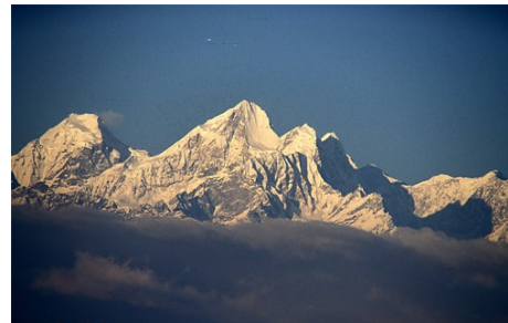
Figure 8 Mount Everest or Sagarmatha, the tallest peak in the center of the picture. It is 29028 ft tall. The highest point on the Earth.