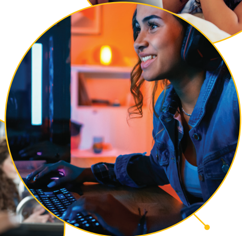
IDENTITY THEFT PROTECTION